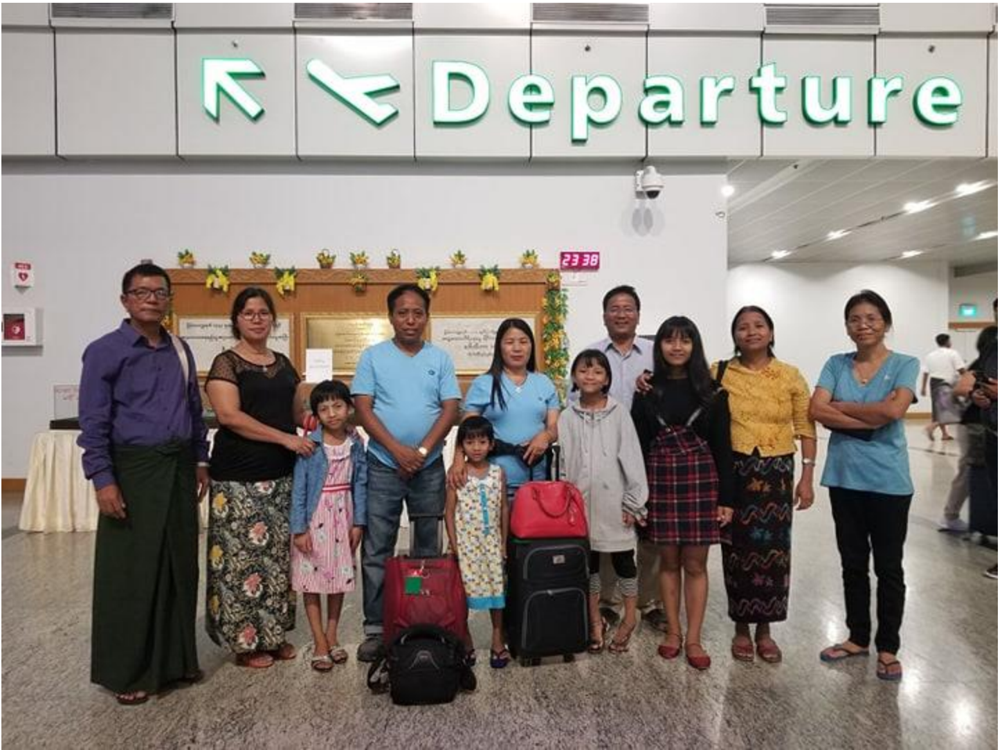
Yangon Airport lata miavaw chhitha tuhpa

Eima chakaona zy a chhâkhai tawta eima khisana râh pangai ba awpata Yangon International Airport tawta March 28, 2019 noh ta a vaw thao pita Khazohpa a chhithana byhna miah patosa ta, a tlâpata Indianapolis cha eima vaw tlô. Thla 3 chhô khi eima tlyna liata tlâna byhna, hlaotlona byhna miah a pietuhpa Abeipa Zisu moh he chhazaw ta reithai pata y mawh sy.