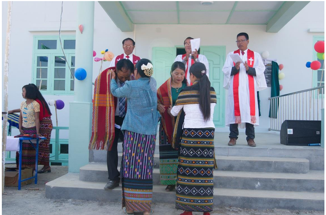
Ahladya Poh pabuna