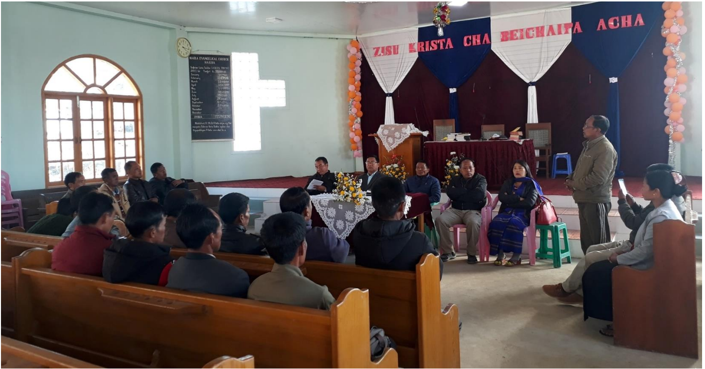
MEC Hiakha Local Nopawzy nata atyhna

February 5, 2019 Hiakha tawta Kalay lâ siepa châta Kalay MEC Local nopaw zy, KNP nata MSA Kalay Branch zy na ta hmaokha ta daihti hmâkhona eima hnei.