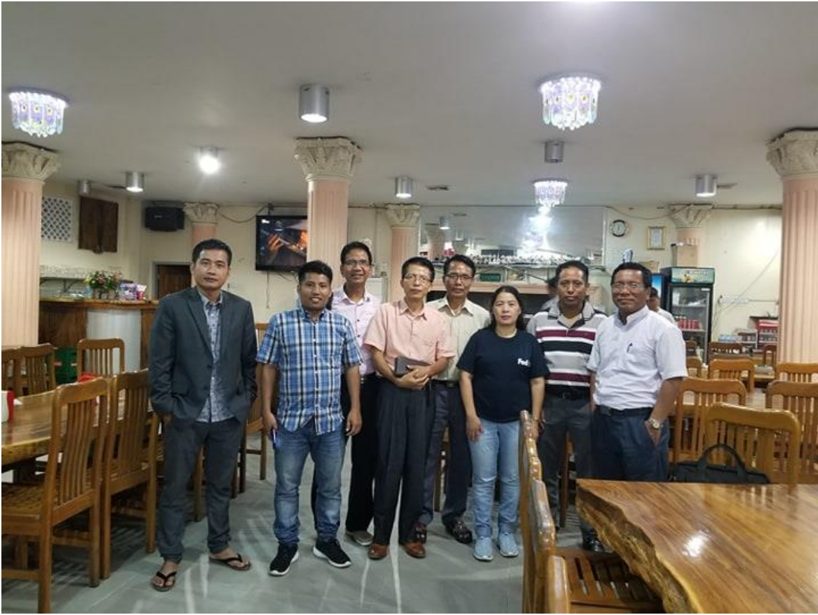
Yangon Mara Christian Fellowship Nopawzy