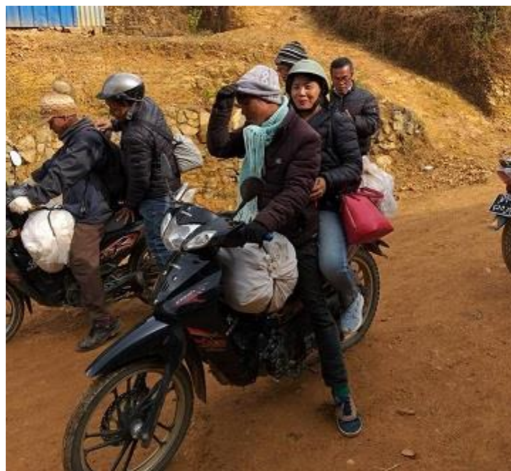
Eima si chyba awh Atlapata sy Maraland