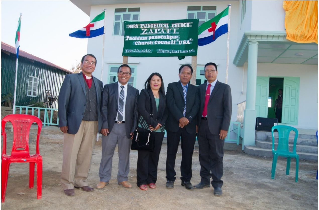
Dinner liata Pastor thokhazy na ta