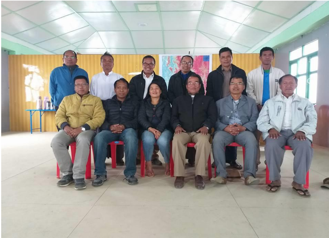
Assembly Council Nopawzy nata atheithlana

Office pahyna nata EC metei a chhâ khai tawta Assembly Council nopawzy nata atyhna hneipa châta General Secretary tawta Foreign Local (MECa) Constitution thatih, Financial thatih, Awnanopa chhithatuhpa zy Pastor, Awnano Macha, Khichho Macha zy Training thati, zy reina hneita, Moderator nata AGS tawta MECA awnanopa hnota alyna bie reina, tha patlôna bie, khokheina bie zy reina a hnei.