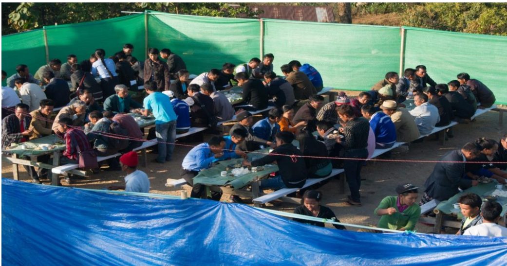
Zawpi aly kawpata he hawta zapati eima hly