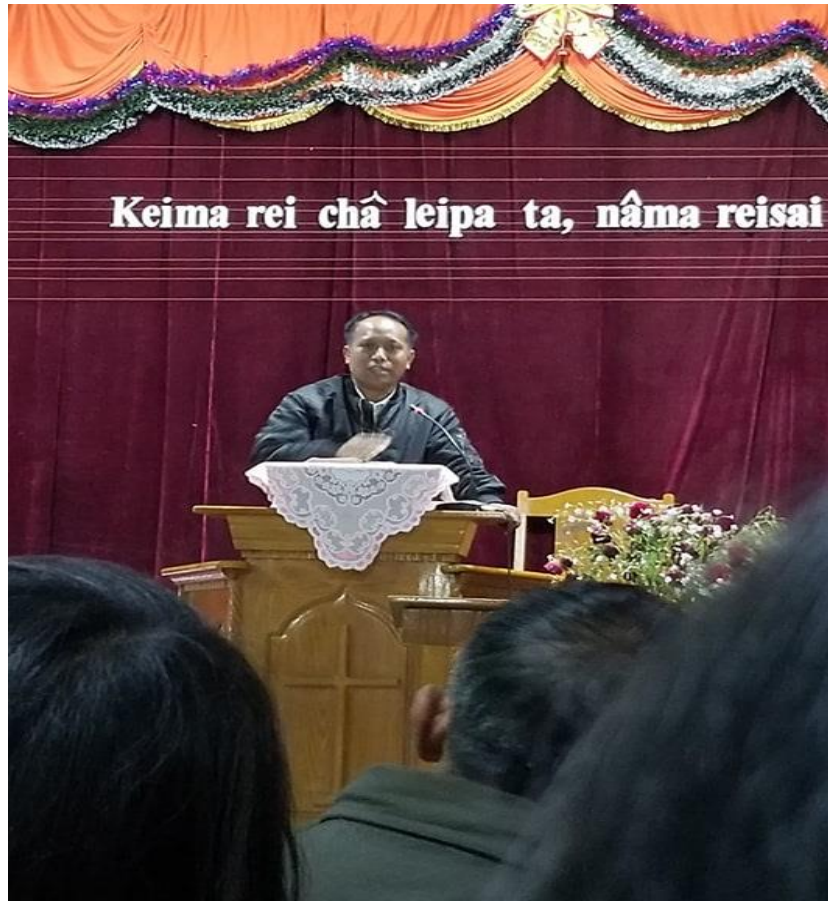
Kalay MEC Local liata Sermon