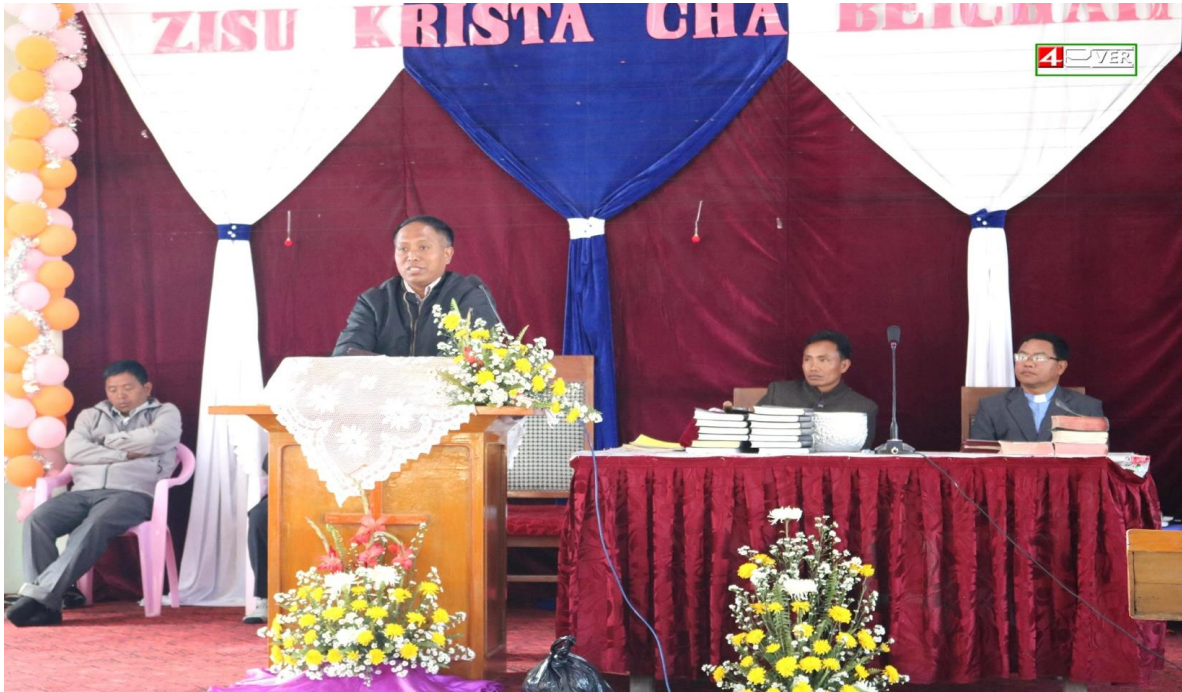
Hiakha Local liata Sermon