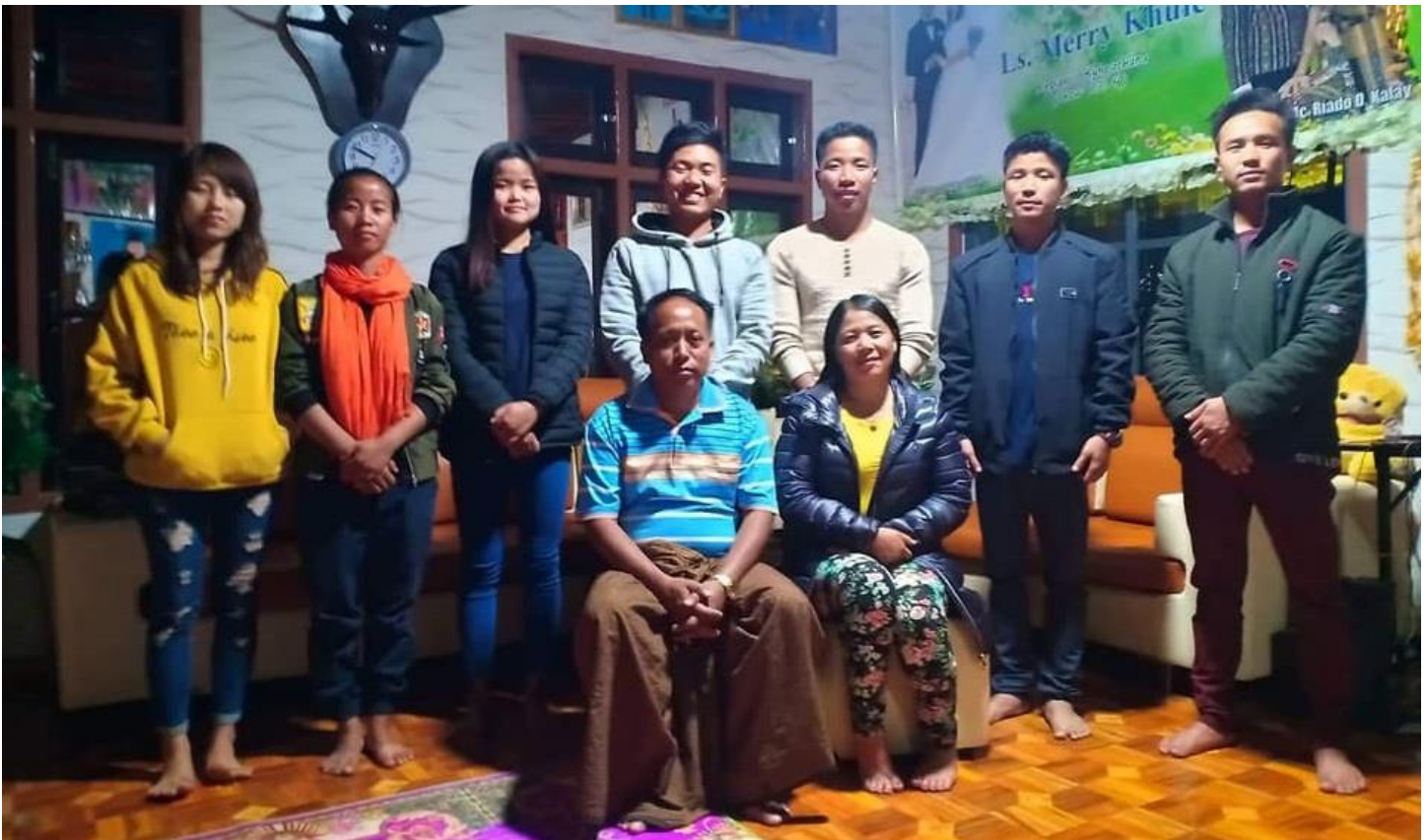
MSA Kalay Branch Chhitha tuhpaZY

February 5, 2019 Hiakha tawta Kalay lâ siepa châta Kalay MEC Local nopaw zy, KNP nata MSA Kalay Branch zy na ta hmaokha ta daihti hmâkhona eima hnei.